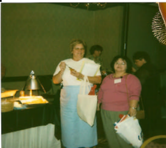
Georgia DMA Food Shows are the Best!!!!