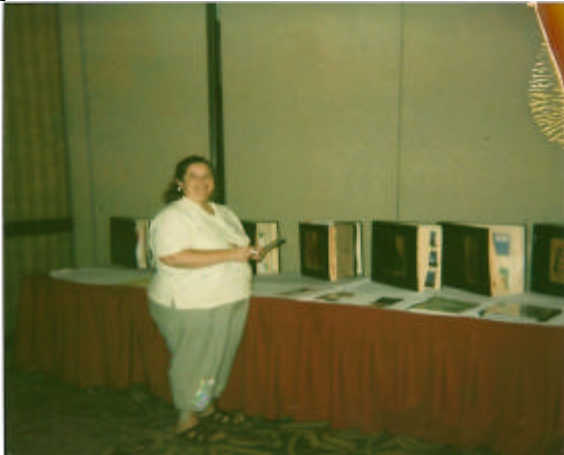
Looking Back at the History of the GADMA is one Of the most enjoyed area of our meetings.