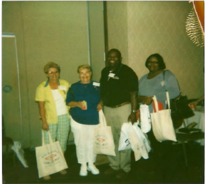
Wonderful Food Show with Great Vendor Participation