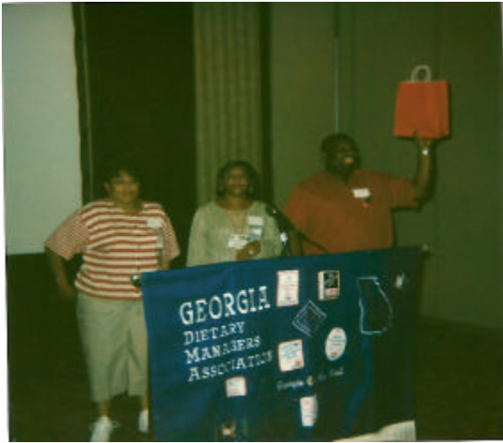
Our Famous Secret Auction