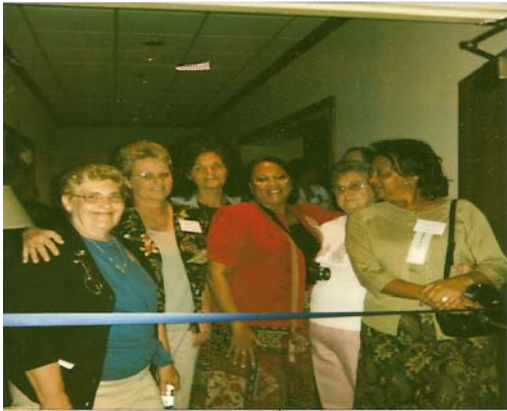
Fall Food Show Ribbon Cutting